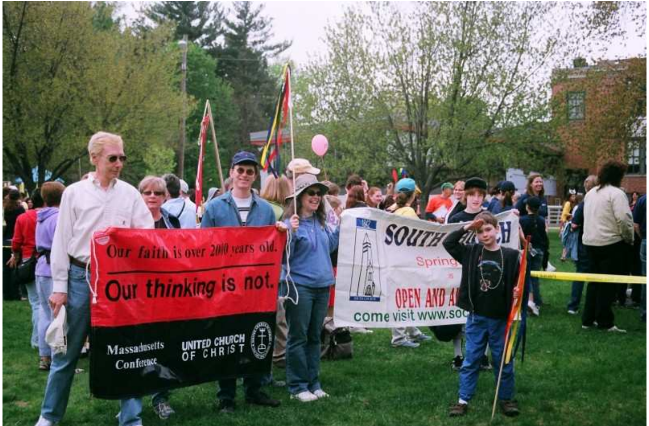
The picture above is of some South members at the Pride Parade in Northampton on May 2, 2009.